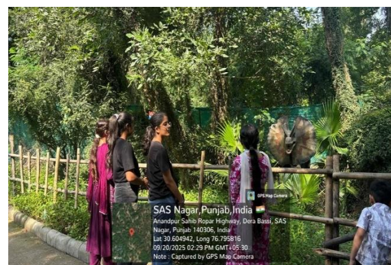
Students of Agriculture Department, SGTB Khalsa College, during an educational visit to Mahendra Chaudhary Zoological Park, Chattbir under DBT Star Status