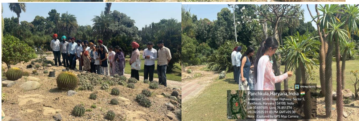
Students of Agriculture Department, SGTB Khalsa College, during an educational visit to Cactus Garden under DBT Star Status