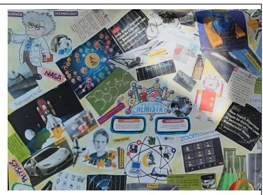
Some glimpses of the event